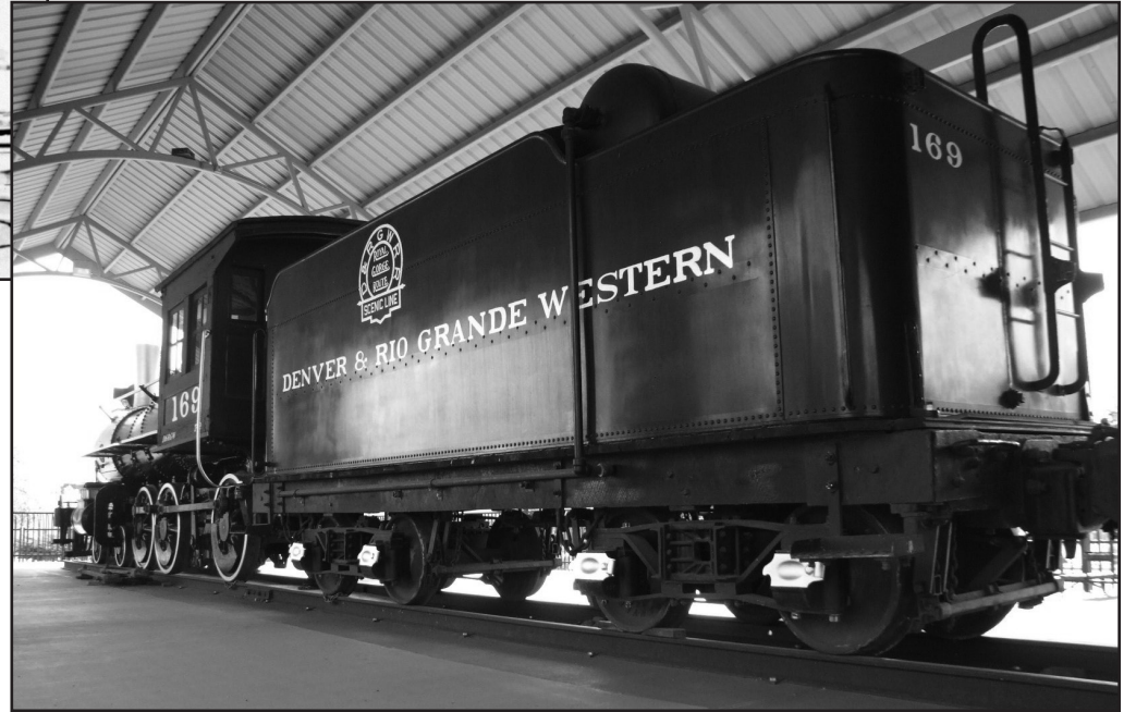
169 today, note straight Stack!