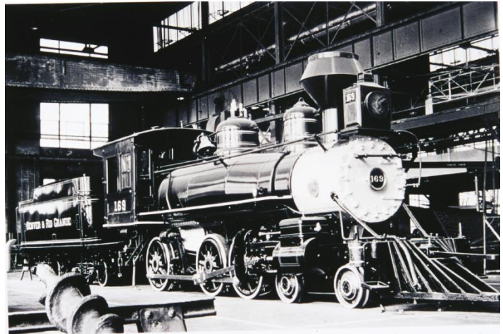
In 1939, the 169 was refurbished at Burnham Shops in Denver for the New York World's Fair.