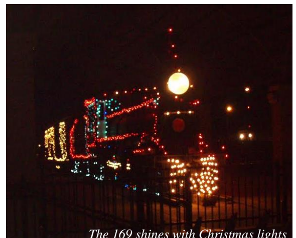
The 169 shines with Christmas lights